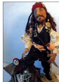
Inspirations! Gallery - Page 50