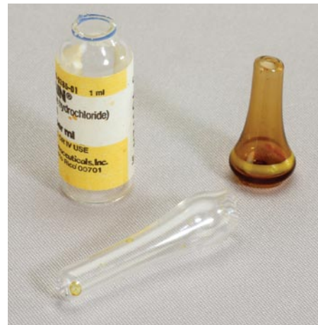
Two "globes" cut from ampul and one ampul base.

Hint: You can save money by finding adapters at yard sales. Otherwise buy one at an electronics store.