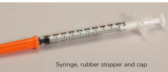
Syringe, rubber stopper and cap

the lantern, use a syringe to make a hole in the rubber stopper from a hypodermic syringe. The stopper will help hold the grain of wheat or rice steady.